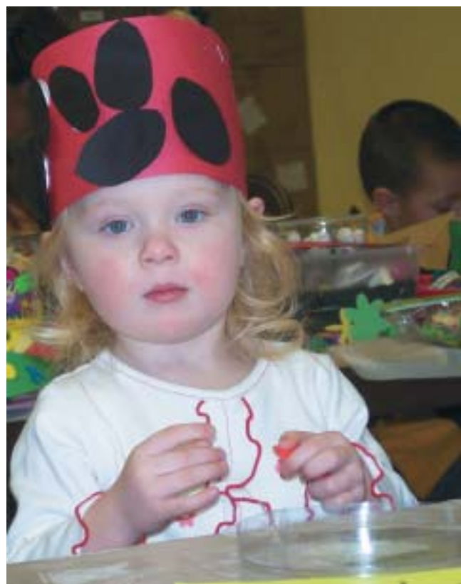
This young tot sports a hat she and her mom made during the January Tot Spot program, titled "Hats, Hats, Hats!" Tot Spot is a popular program, held the first Thursday and Friday of each month. The programs is for 2-5-year-olds, and teaches them about different art forms, while educating them about different exhibits in the Museum.