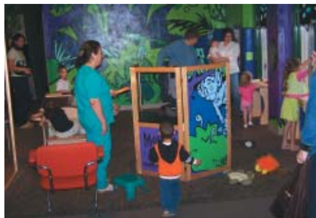
Young and old alike enjoy the A is For Animal exhibit in the Children's Museum during the monthly ArtWalk, which is held the second Thursday of every month from 5-8 p.m.