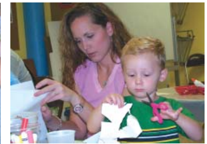
Under the watchful eye of his mother, a young tot practices his scissor skills at the monthly Tot Spot program. Tot Spot is offered the first Thursday and Friday of each month for children age 2-5.