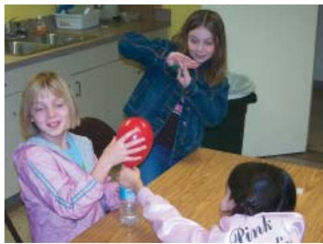
Three young ladies anticipate and prepare for the results of an experiment during Celebrate Science Saturday January 20.