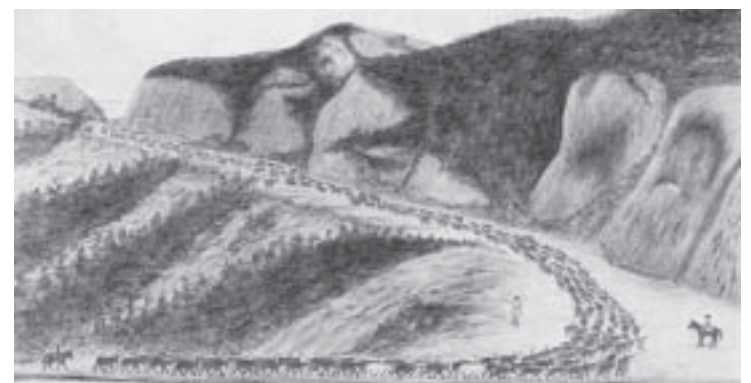
Climbing The Break in the Cap Rock to the Plains Nickel pencil drawing on tablet paper; 12" x 15"; 1886; D.D. Parramore