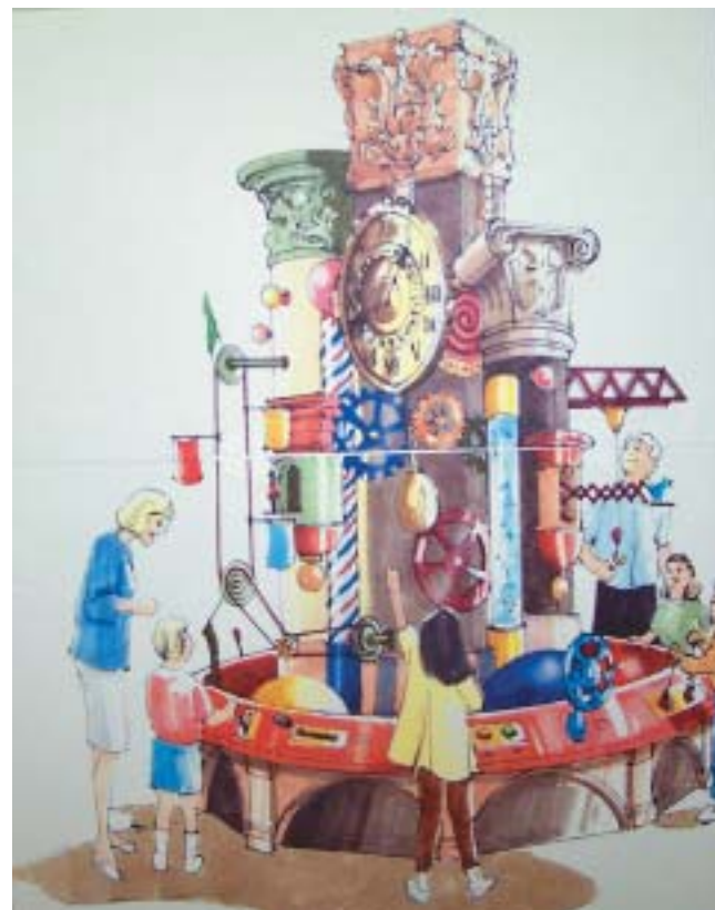
This artist's rendering depicts the working clock tower that will be one of the new exhibits in the renovated Children's Museum.

The health and fitness area will explore the human skeleton with a life-size "Operation" game table, Mr. Bones on a bike, X-rays and light table, an ambulance (again re-inventing our VW bug),