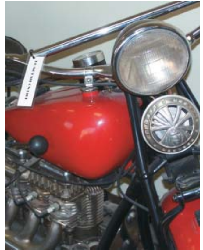
This vintage motorcycle, a 1950 Indian Chief, is one of more than 30 motorcycles that will be on exhibit.