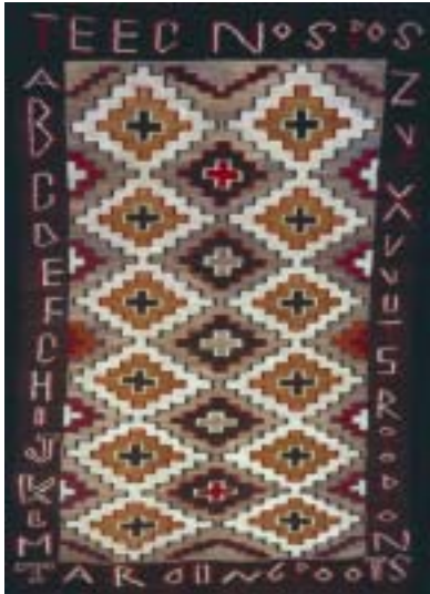
Teec Nos Pos Weaving Circa 1920, weaver unknown